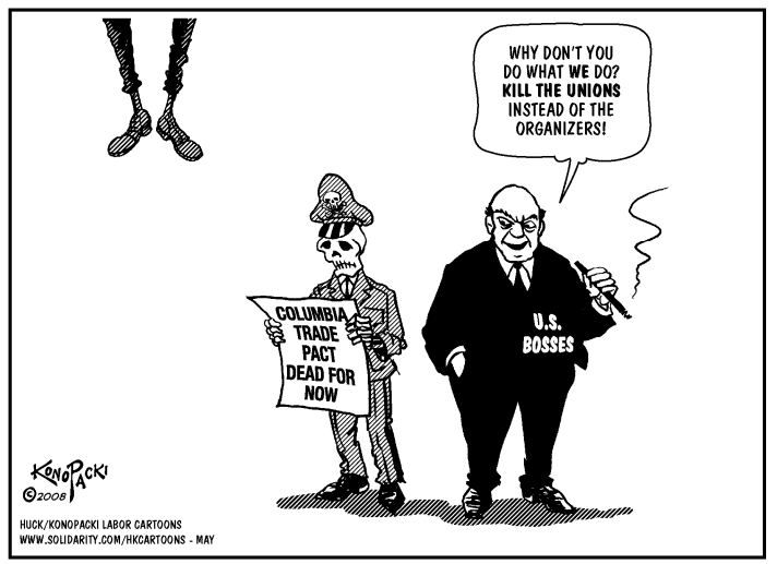
When Right Becomes Wrong - (continued)